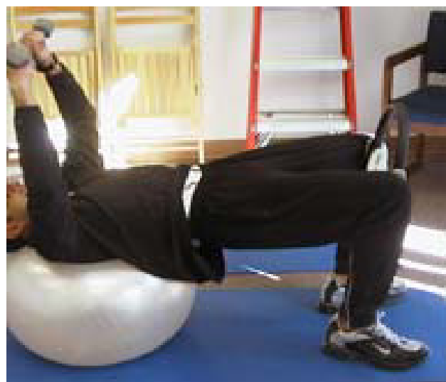
Figure 2 Bridging with shoulders on a ball.